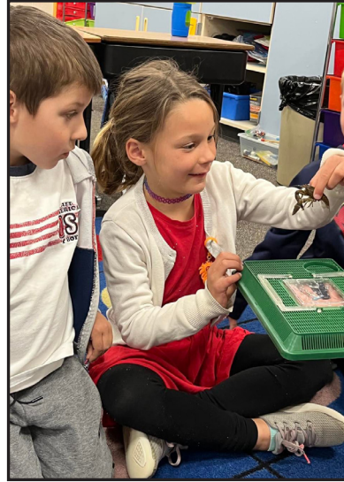
Students at Tanner Early Learning Center learned about crayfish from our friends at 1000 Islands Environmental Center.