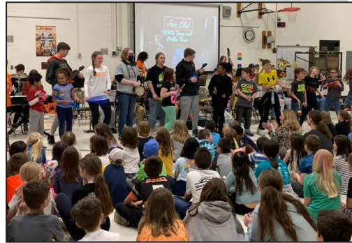
Haen Hawks had a little fun celebrating music when the KHS Polka and Jazz Band stopped by.