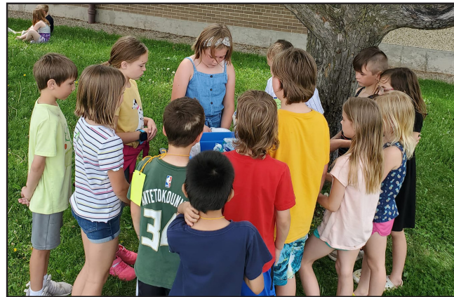
NDLC 4th grade students spent weeks planning and preparing mini courses for younger classmates, a 10-year tradition!