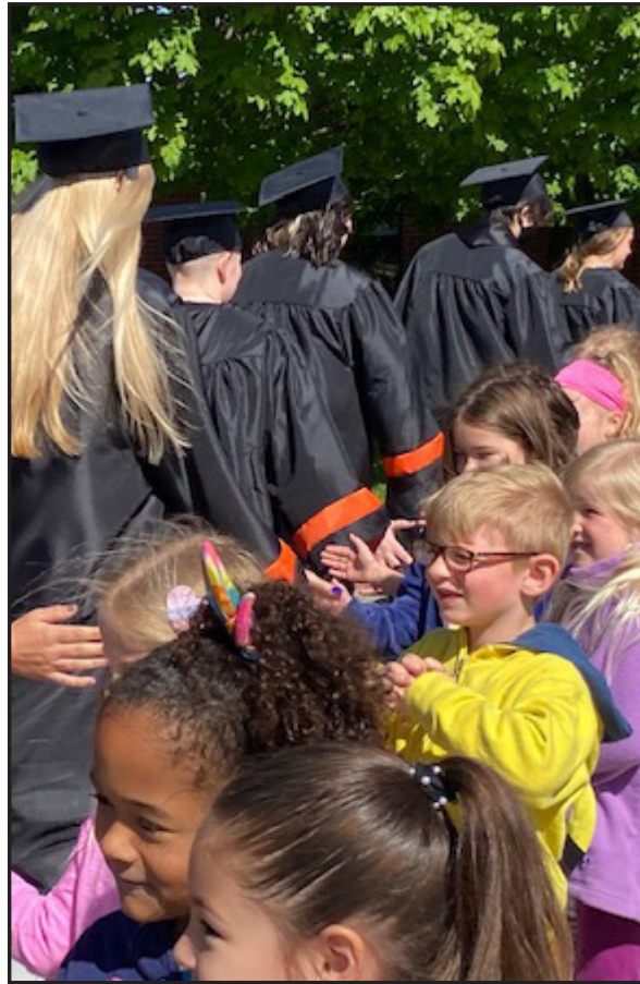
Kaukauna High School Class of 2022 reflected on their journeys during the Tour of Graduates in May.