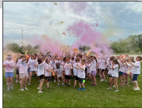
Electa Quinney Elementary School students and staff had a blast at the annual color run/walk and festival, raising money for the school. The dunk tank was a hit!