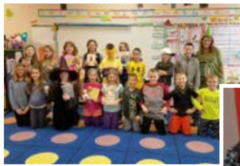
New Directions Learning Community: Students and teachers alike dressed as their favorite literary character on "Book Character Day." Teachers teamed up to dress as the crayons from The Day the Crayons Quit and everyone was part of our character parade!