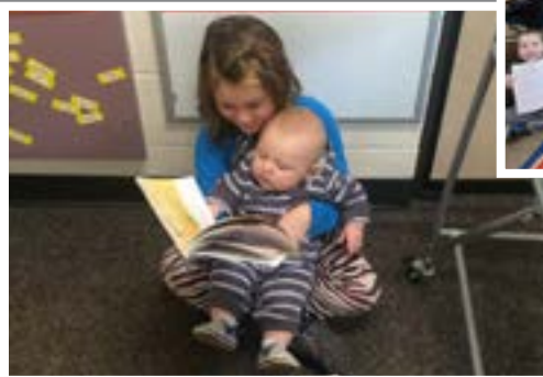
Tanner Early Learning Center: January was a time to "Cozy up and Read" at Tanner. Family and friends were invited into our school to sit together, snuggle and read to one-another. One of our 1st grade students decided that it was a great time to lead in our next generation of young learners!

"I am so proud of their determination and perseverance to put their keyboarding skills into meaningful application, integrating reading, writing, speaking and listening and technology! They are passionate and feel strongly about their Conscious Discipline opinion writing! Way to go second graders!"